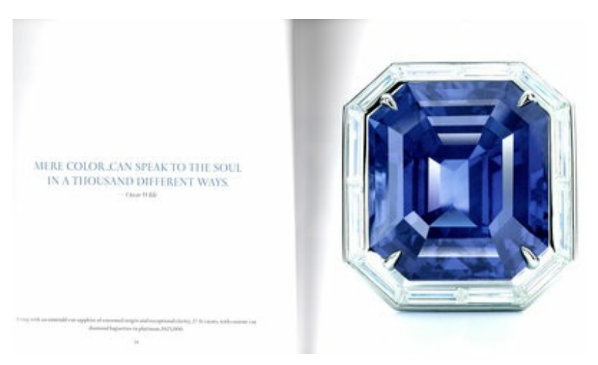
Tiffany sapphire ring with Oscar Wilde quote

Other quotes were more color-specific such as the Goethe quote that read, "With yellow, the eye rejoices, the heart expands, the spirit is cheered and we immediately feel warmed." The literary great's quote was meant to emphasis the 20.70 carats of yellow beryl briolettes used in $50,000 platinum earrings.