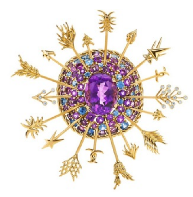
Tiffany & Co.'s Arrow clip