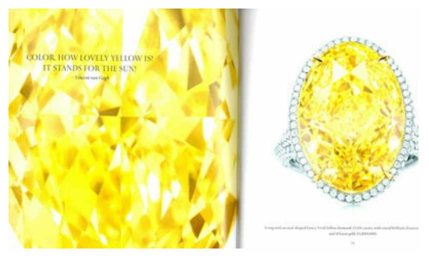
Tiffany's Fancy Vivid yellow diamond ring with an Vincent van Gogh quote

Also included was a $2.5 million, 10.74-carat emerald-cut diamond ring and a $3.8 million 15.04 oval-shaped yellow diamond ring.