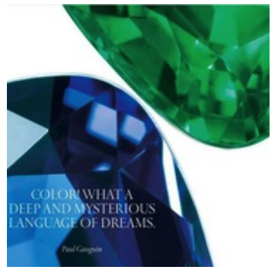
Imagery from Tiffany & Co.'s 2014 Blue Book