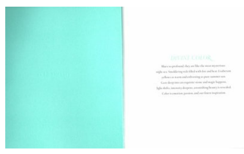
Foreword of Tiffany's 2014 Blue Book

The 108-page Tiffany 2014 Blue Book began with a short foreword that compared blue to the night sea, red to fire and yellow to a summer sun. The foreword concluded by stating, "Color is emotion, passion and our finest inspiration" and set the tone for the pages to come.