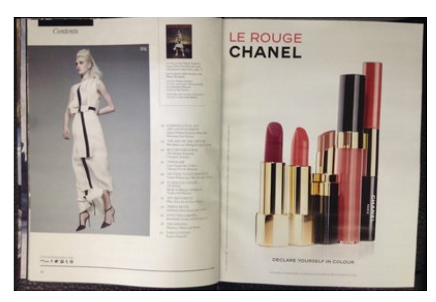
Chanel Le Rouge lipstick ad opposite the table of contents

Clive Christian's eponymous fragrance, Lancôme, Sisley, Tom Ford beauty and Jo Malone's orange blossom fragrance appear before the table of contents. Chanel continued the trend opposite the table of contents with an ad for its different types of lip color.