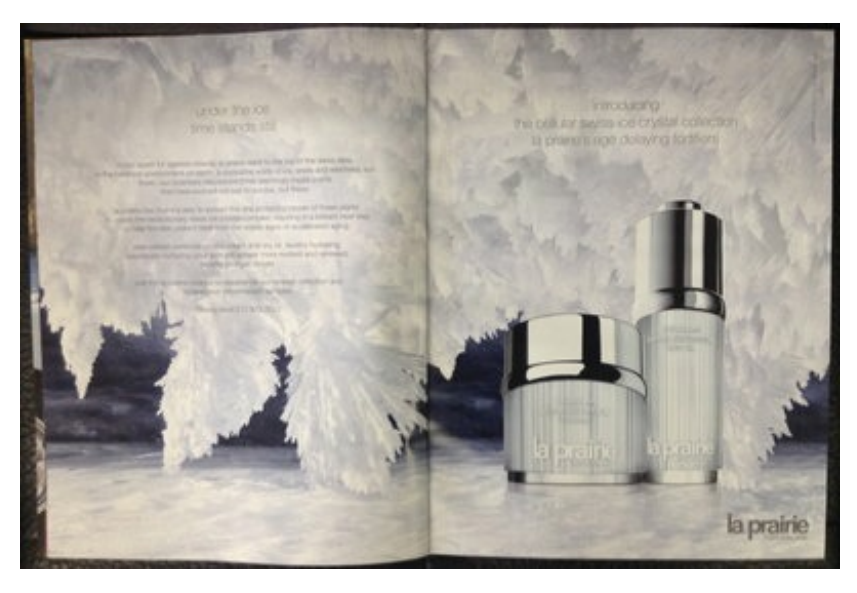
La Prairie effort

Clive Christian's eponymous fragrance, Lancôme, Sisley, Tom Ford beauty and Jo Malone's orange blossom fragrance appear before the table of contents. Chanel continued the trend opposite the table of contents with an ad for its different types of lip color.