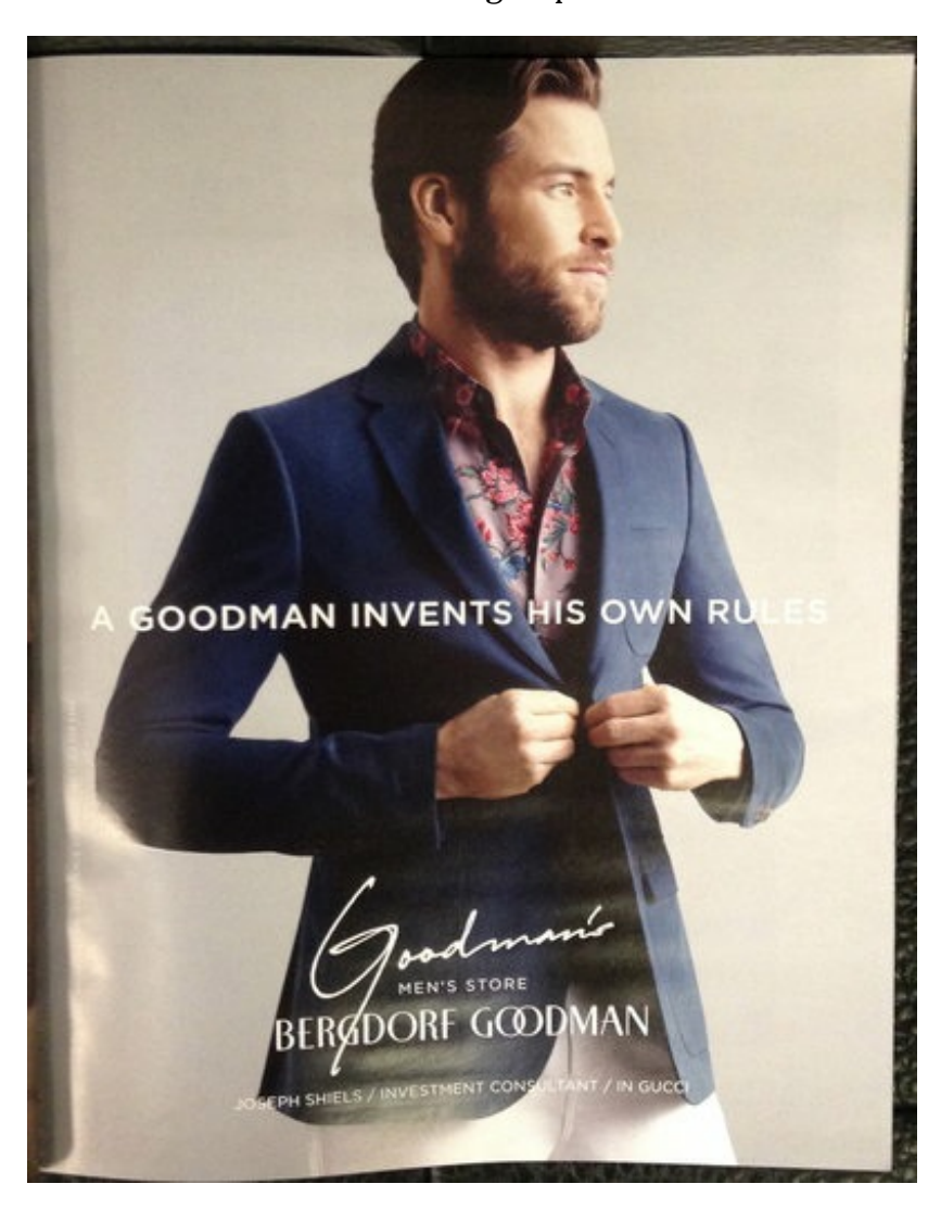
One of Bergdorf Goodman's Men's Store ads

across the street from its flagship on Fifth Avenue.