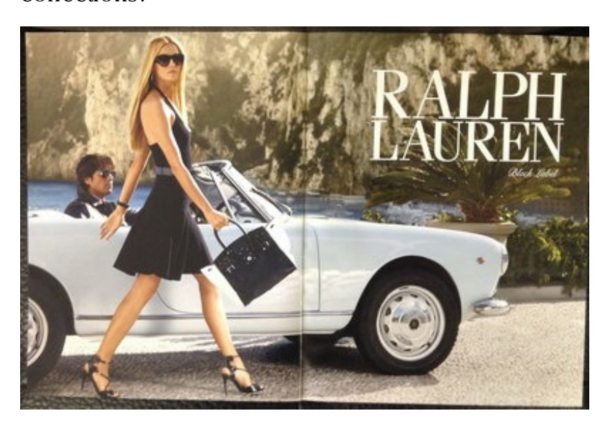
Ralph Lauren Black Label, seen in inside front cover of the women's issue

The front cover of the women's section featured an ad for Ralph Lauren's Black label, while on the reverse side of the magalog, the men's issue included an ad for Ralph Lauren's Purple Label. As Ralph Lauren continues to reposition itself toward a focus on its luxury lines, it is vital to be seen by those affluent enough to purchase from the collections.