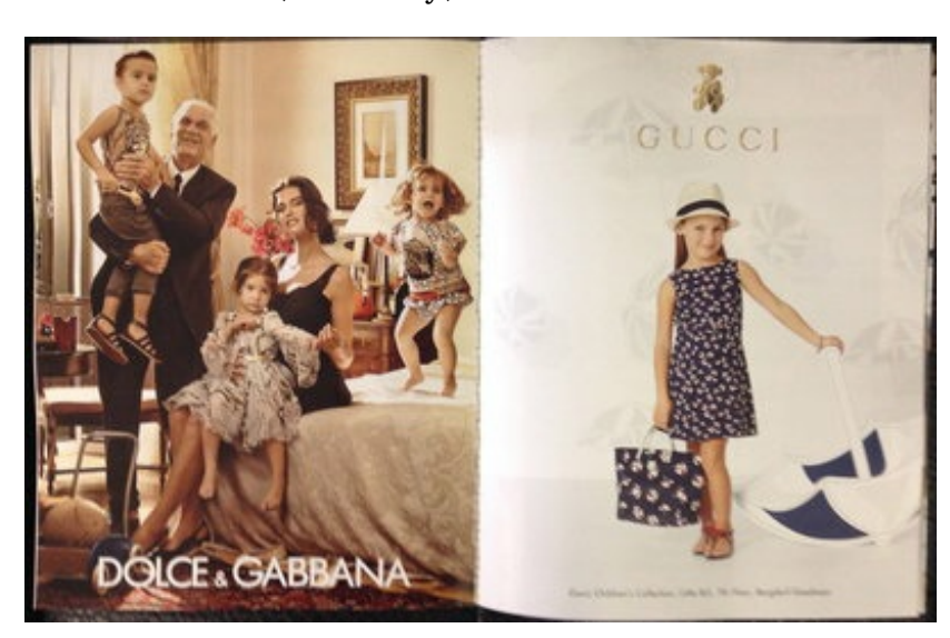
Children's collections from Dolce & Gabbana (left) and Gucci (right)

Near the end of Bergdorf Goodman's women's side of the magalog, the retailer featured two ad efforts from Dolce & Gabbana's and Gucci's children collection. Interestingly, these campaigns were placed across from one another after a spread with other brands such as Lanvin, Burberry, Moncler and Marni were featured.