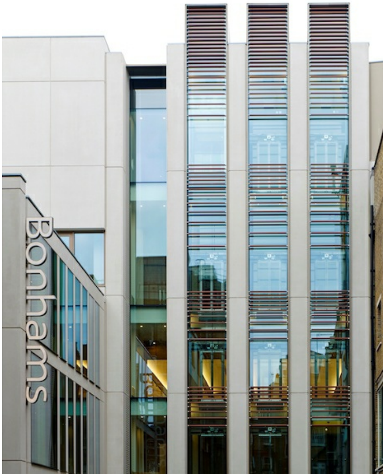
Bonhams' headquarters is at 101 New Bond Street.