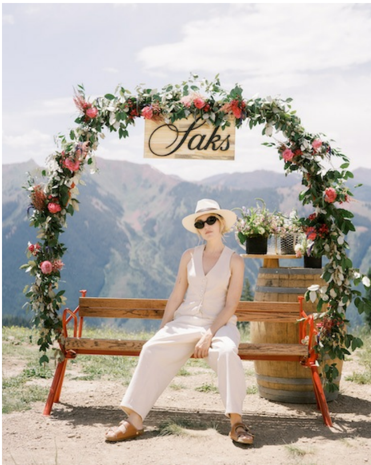
Chloe Fineman at Saks Aspen Mountaintop Picnic.

All in all, LVMH in 2022 outshone its rivals in marketing, retail, merchandising, talent recruitment, supply chain control and shareholder value generation. More impressive, it is run like a business more in line with those in consumer packaged goods and mainstream retail. LVMH may be family controlled, but it is professionally run and the results showed in 2022. That is why it is Luxury Daily's Luxury Marketer of the Year.