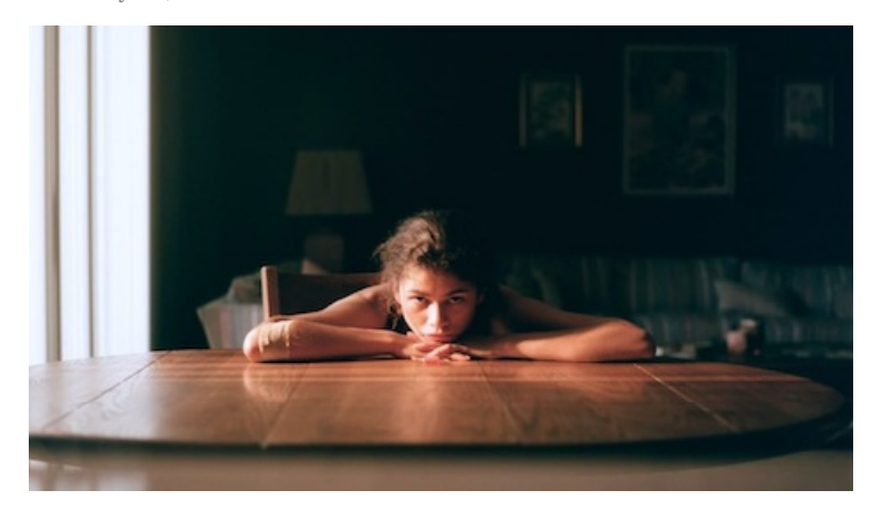
Zendaya stars in the hit HBO series "Euphoria."