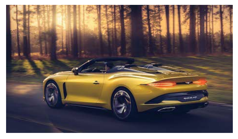
Bentley Motors is one of several luxury brands featured in the Luxury Women to Watch 2022 honor. Seen here: the pre-production Bentley Bacalar.