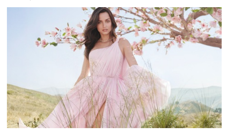
Ana De Armas is the face and voice of the brand's latest love campaign.