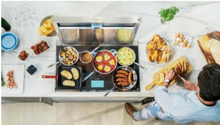
Thermador cooktops can now be controlled through its mobile application.

They are more motivated to purchase smart appliances than the general population, and are more likely to cite factors such as convenience, cost savings and environmental benefits. However, both early adopters and the general population of U.S. consumers named data privacy as the leading concern over smart applications.