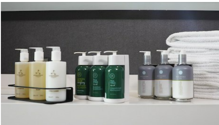
Marriott is getting rid of single-use plastic toiletry bottles.

Actress and activist Zendaya stars in the "I Can, We Will" effort for Lancme's Idle scent. Pairing the young star with a feminist message will help the prestige brand resonant with millennial and Generation Z consumers ( see story ).