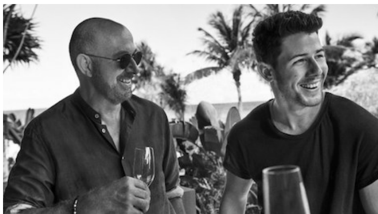
Villa One Tequila is launching next month.

Here are the top five brand moments from last week, in alphabetical order: