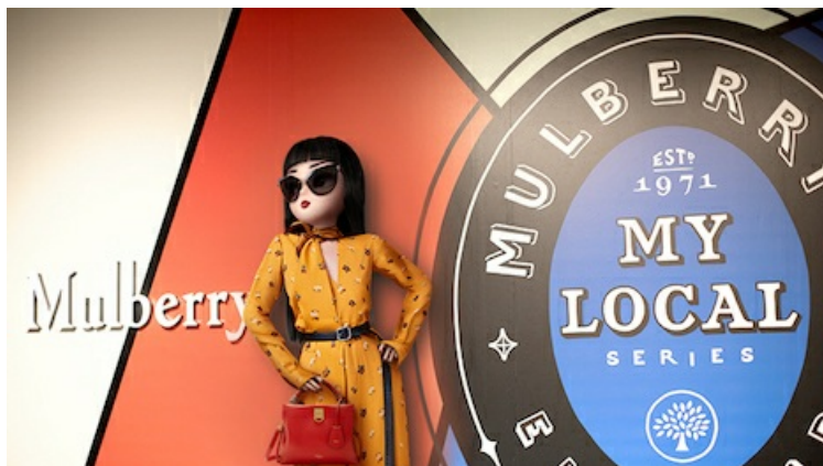
Noonoouri "went" to Tokyo for a Mulberry partnership.