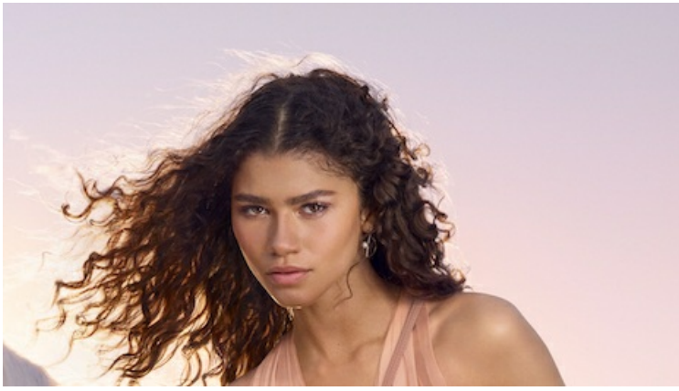
Zendaya fronts Lancme's new fragrance campaign.

Beauty brand Lancme is embracing feminism with a star-powered campaign for its latest fragrance.