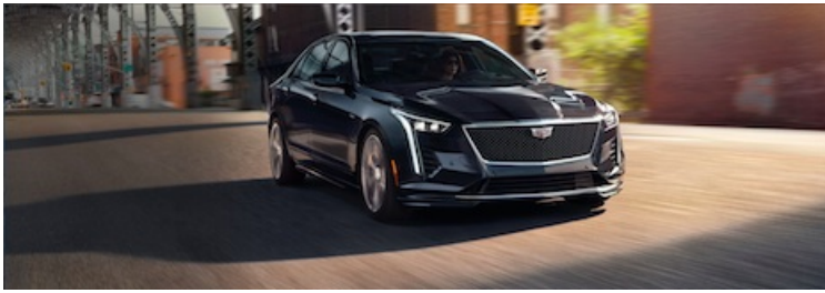
The 2019 Cadillac CT6 sedan, sold out for this year and potentially tapped out for next.

Stand a Cadillac in front of these peers and it is instantly obvious. The CT6 soon to be discontinued, per the NYT article is diminutive and lacks the gravitas. The lower-end Cadillac sedans do not even match up to the similarly ranked Jaguars, Audis, BMWs and Mercedes'.