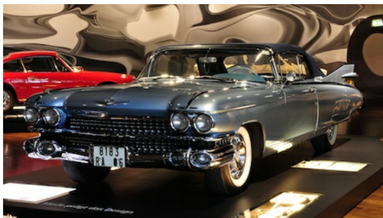
The 1959 Cadillac Eldorado Biarritz in all its glory at a German auto show.