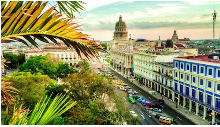
Seabourn is now traveling to Cuba.

Since the travel embargo between the United States and Cuba was lifted, the Caribbean nation has also been a hot spot for affluent vacationers.