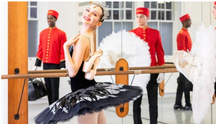
Cunard announced partnership with English National Ballet.

In a partnership with the English National Ballet, Cunard is providing guests with a rare opportunity to not only see a special performance but also a behind-the-scenes look at rehearsals and meet the dancers during a one-time-only trip ( see story ).