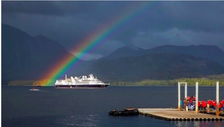
Royal Caribbean made a $1 billion investment in Silversea Cruises.

The industry's resurgence has led to acquisitions as corporations look to expand their cruise and hospitality portfolios.