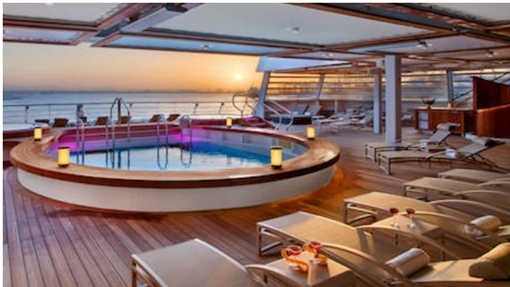
Seabourn has introduced a new wellness program.