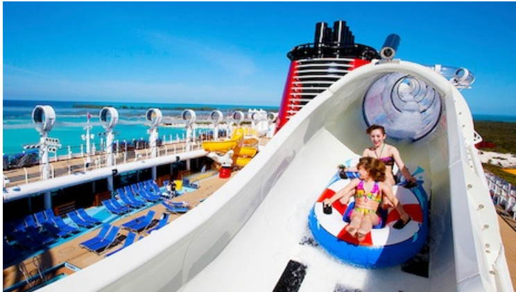
Inspirato is now working with Disney Cruises.

Disney Vacation Club is bringing a variety of packages to customers of private travel club Inspirato, including Disney Cruises and Adventures by Disney excursions ( see story ).