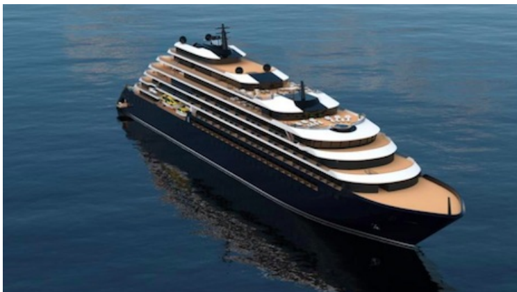
Ritz-Carlton has opened booking for its yachting service.

While the Ritz-Carlton Yacht Collection experience slightly resembles a cruise, the brand emphasizes that the smaller size of its vessels not only provides a more personal and intimate experience, but can also take visitors where the larger cruise ships cannot venture ( see story ).