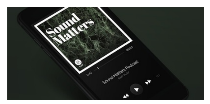
Bang & Olufsen's Sound Matters.

Danish audio and video brand Bang & Olufsen's "Sound Matters" series looks at the sounds that make up daily life around the world. Future episodes of Sound Matters will explore all kinds of sounds that occur in the "noisy cosmos" (see story).