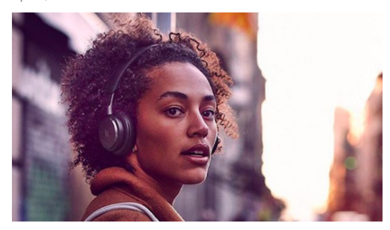
Podcasts offer a way to reach consumers through audio.