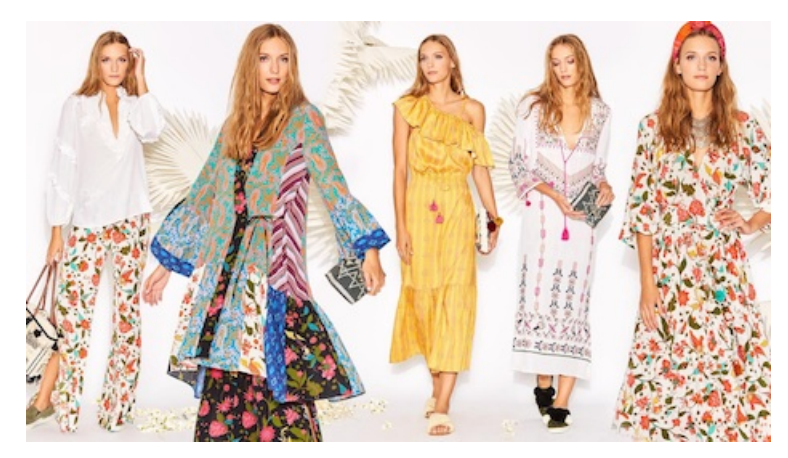
Moda Operandi's spring/summer 2018 collection. The online retailer's CEO is on the 2018 Luxury Women to Watch list.