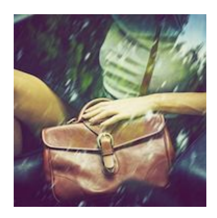
Ghurka Woman campaign image