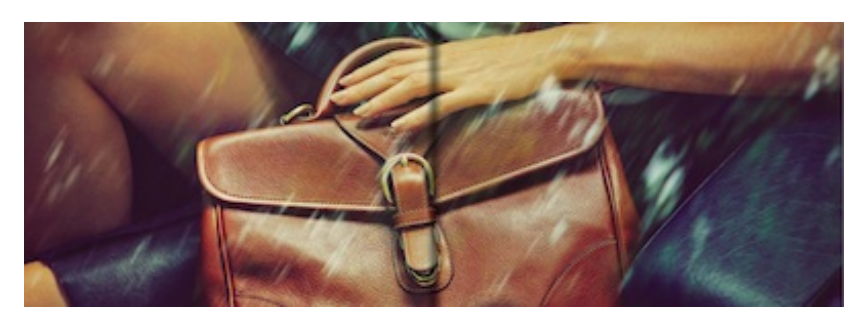
Ghurka Woman catalog