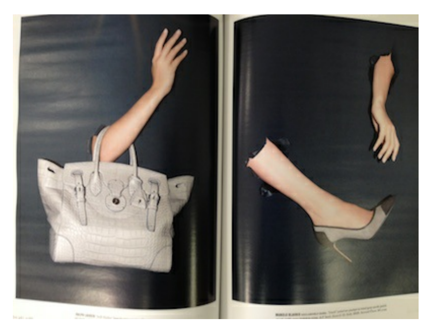
Bergdorf Goodman fall 2014 magazine

"Break Through" placed the emphasis on accessories, showing models' hands and feet poking through navy paper, wearing this season's shoes or toting the latest handbags.