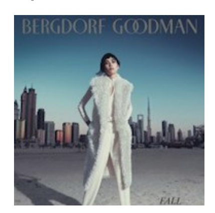
Bergdorf Goodman fall 2014 magazine cover