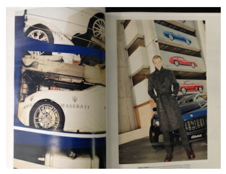
Bergdorf Goodman fall 2014 magazine