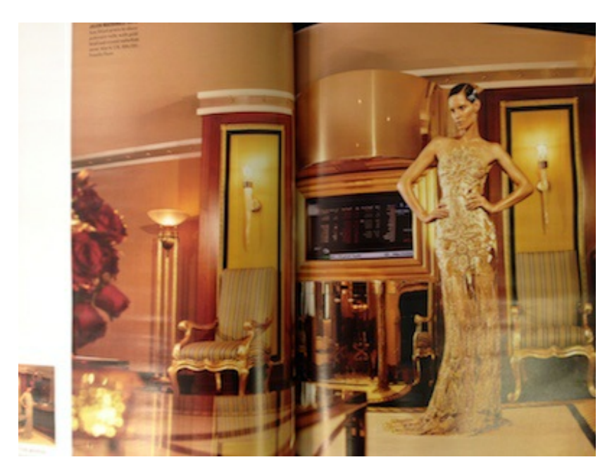
Bergdorf Goodman fall 2014 magazine

"Break Through" placed the emphasis on accessories, showing models' hands and feet poking through navy paper, wearing this season's shoes or toting the latest handbags.